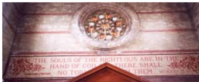
Eastbourne: Above left: All Saints Hospital Chapel. Top right: The Bandstand. Below right: All Souls Church. Below left: former Pier Hotel.

The Tiles and Architectural Ceramics Society would like to thank the following organisations for supporting the Gazetteer Project: